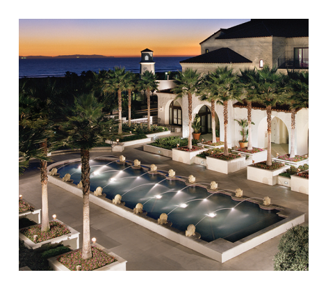
Hyatt Regency Huntington Beach Resort and Spa, Huntington Beach, Calif.